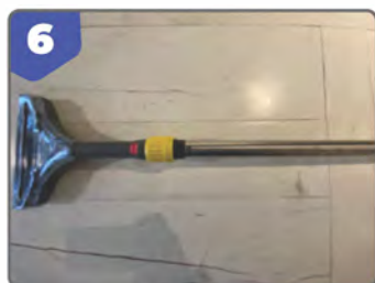
6 Flexible floor nozzle (doesn't fit in the box)