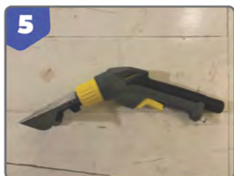
5 Upholstery nozzle