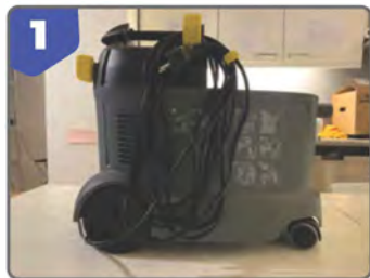
1 Puzzi 8/1 c

Please use this guide to make sure you dont forget to pack anything.