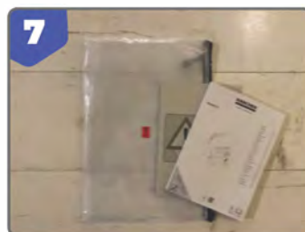
7 Manual(s) + bag