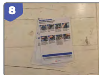
8 BIYU instructions